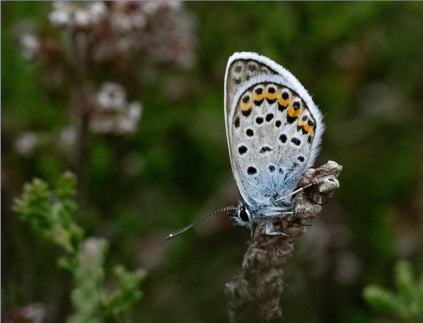
Silver-studded Blue ( Plebejus argus )