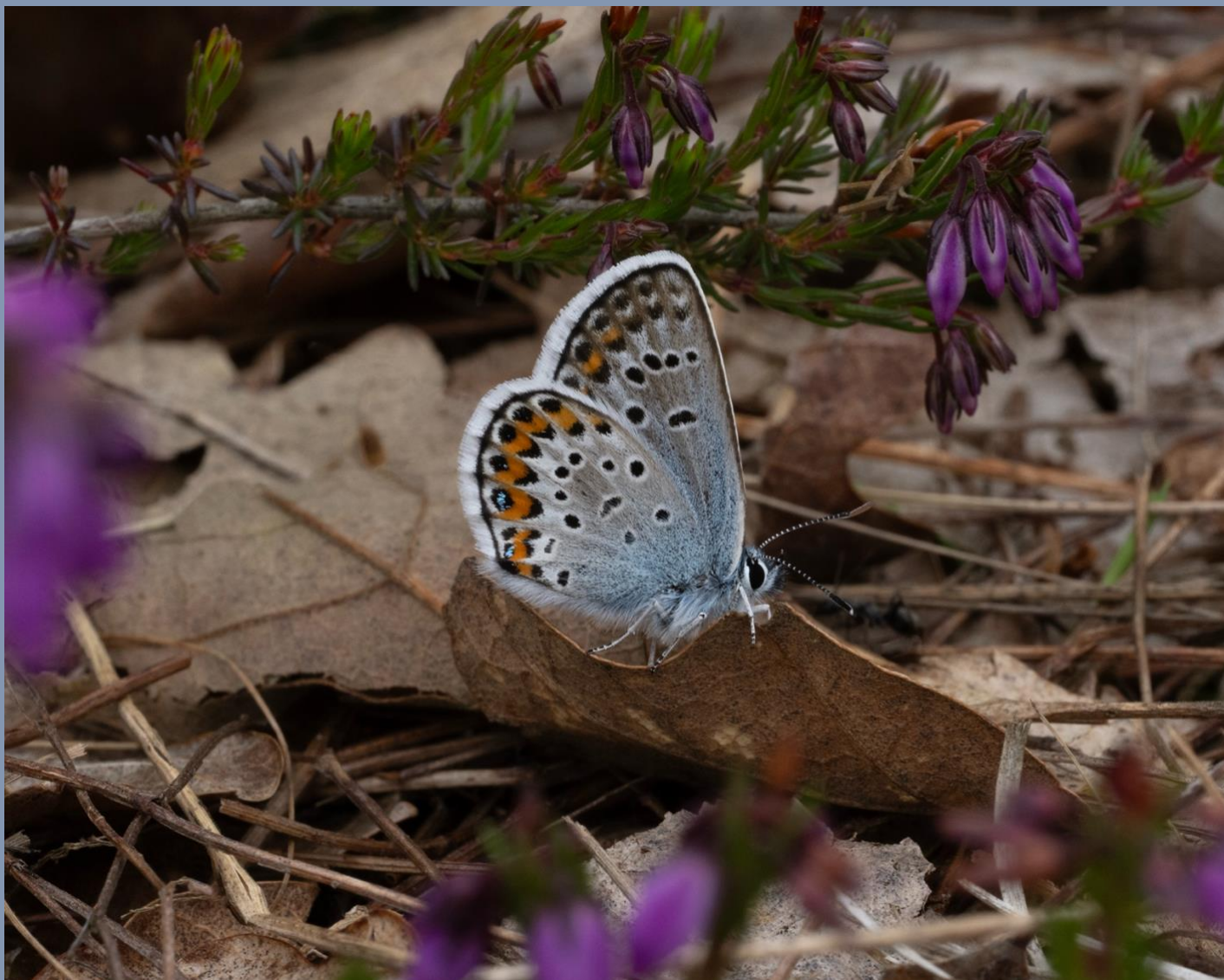
Silver-studded Blue ( Plebejus argus ) Male underwing.