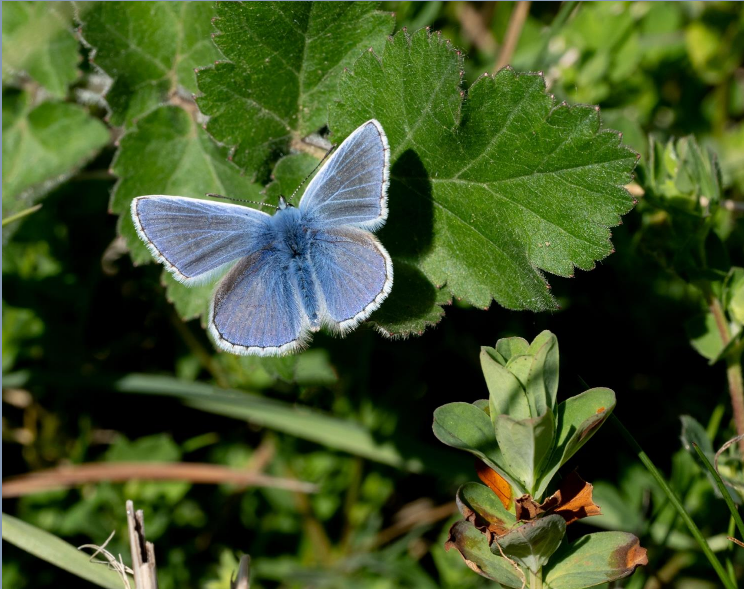
Common Blue ( Polyommatus icarus ) Male.