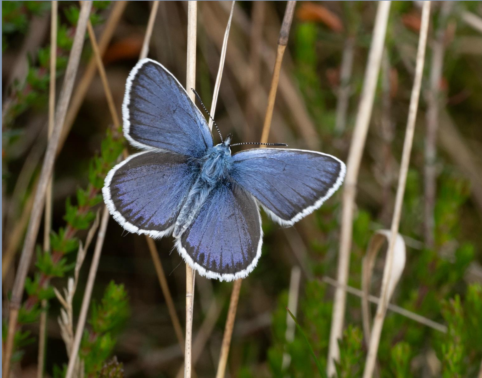
Silver-studded Blue ( Plebejus argus ) Male