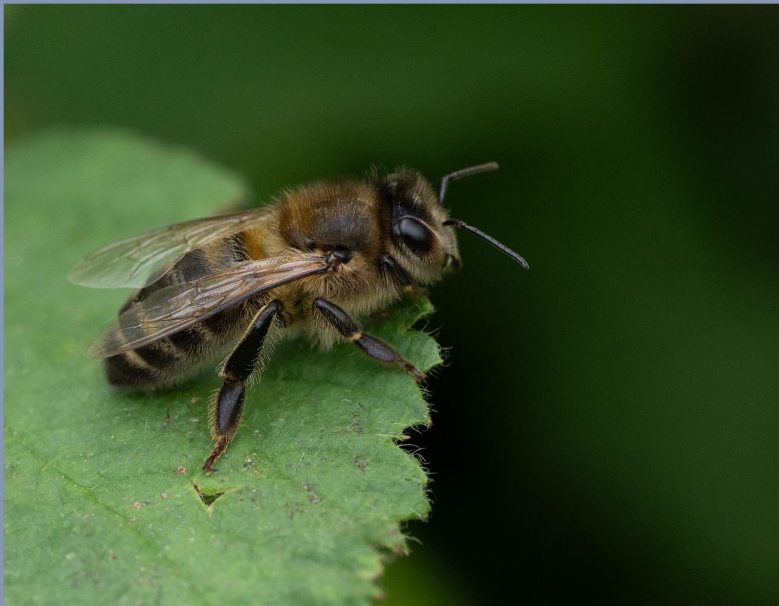
Honey Bee ( Apis mellifera )