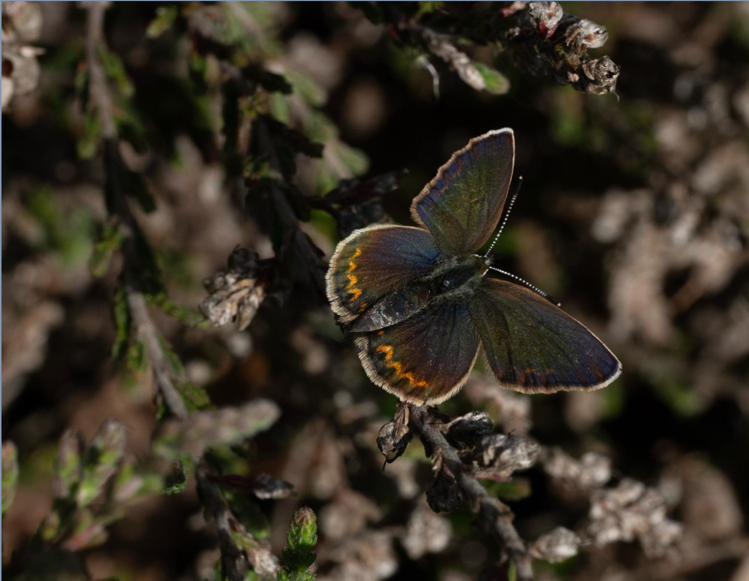
Silver-studded Blue ( Plebejus argus ) Female