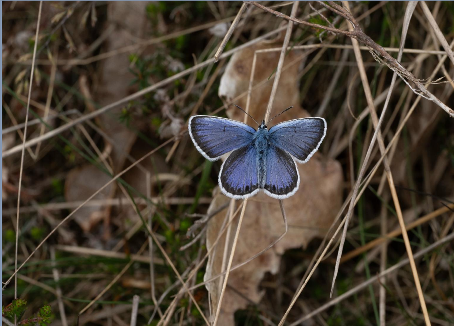
Silver-studded Blue ( Plebejus argus ) Male