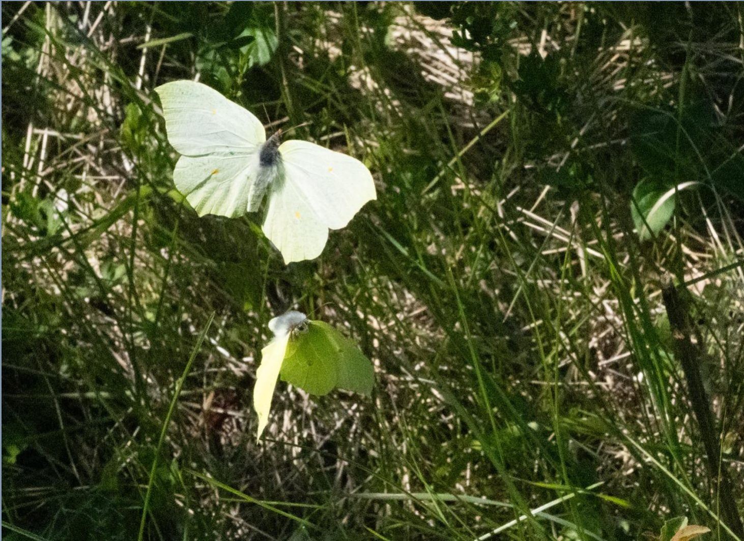
Courting Brimstones ( Tamas Nestor ) Female upper.