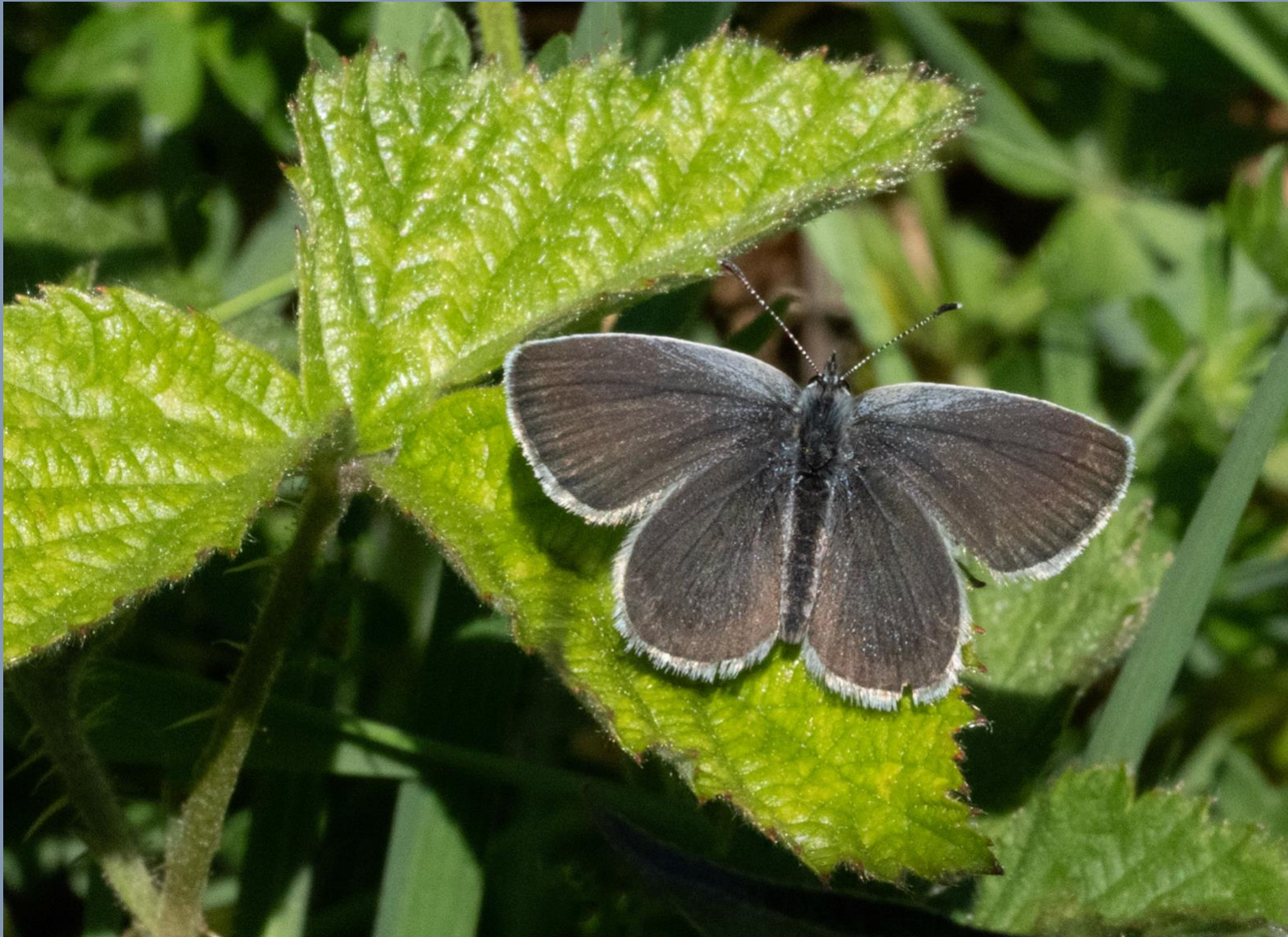
Small Blue ( Cupidi minimus )