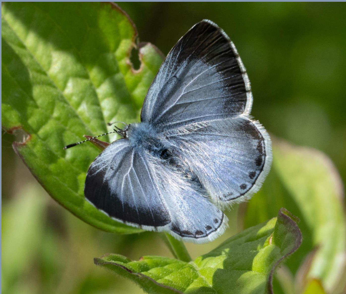
Holly Blue ( Celastrina argiolus ) Female upperside.