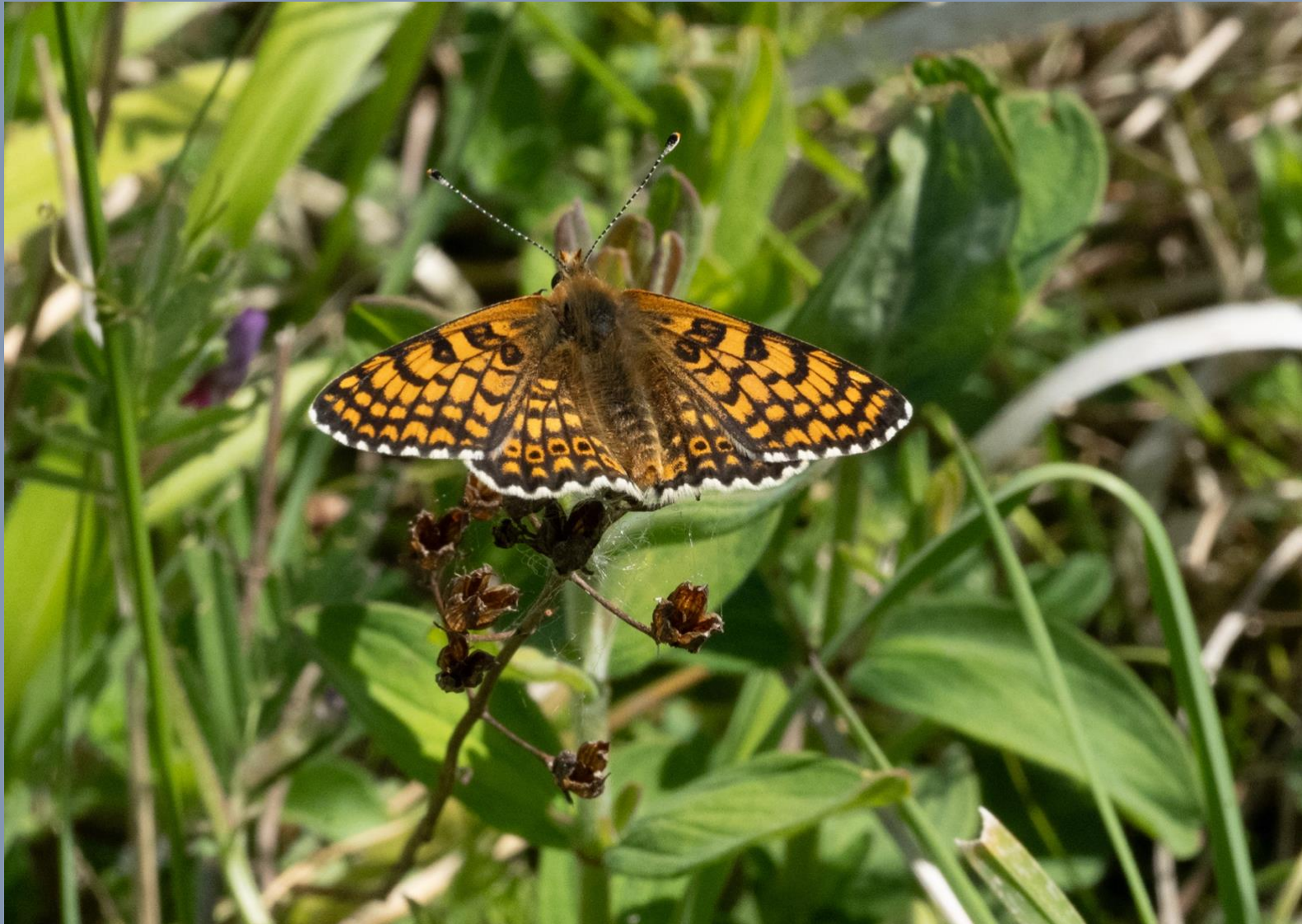
Glanville Fritillary ( Melitaea cinxia )