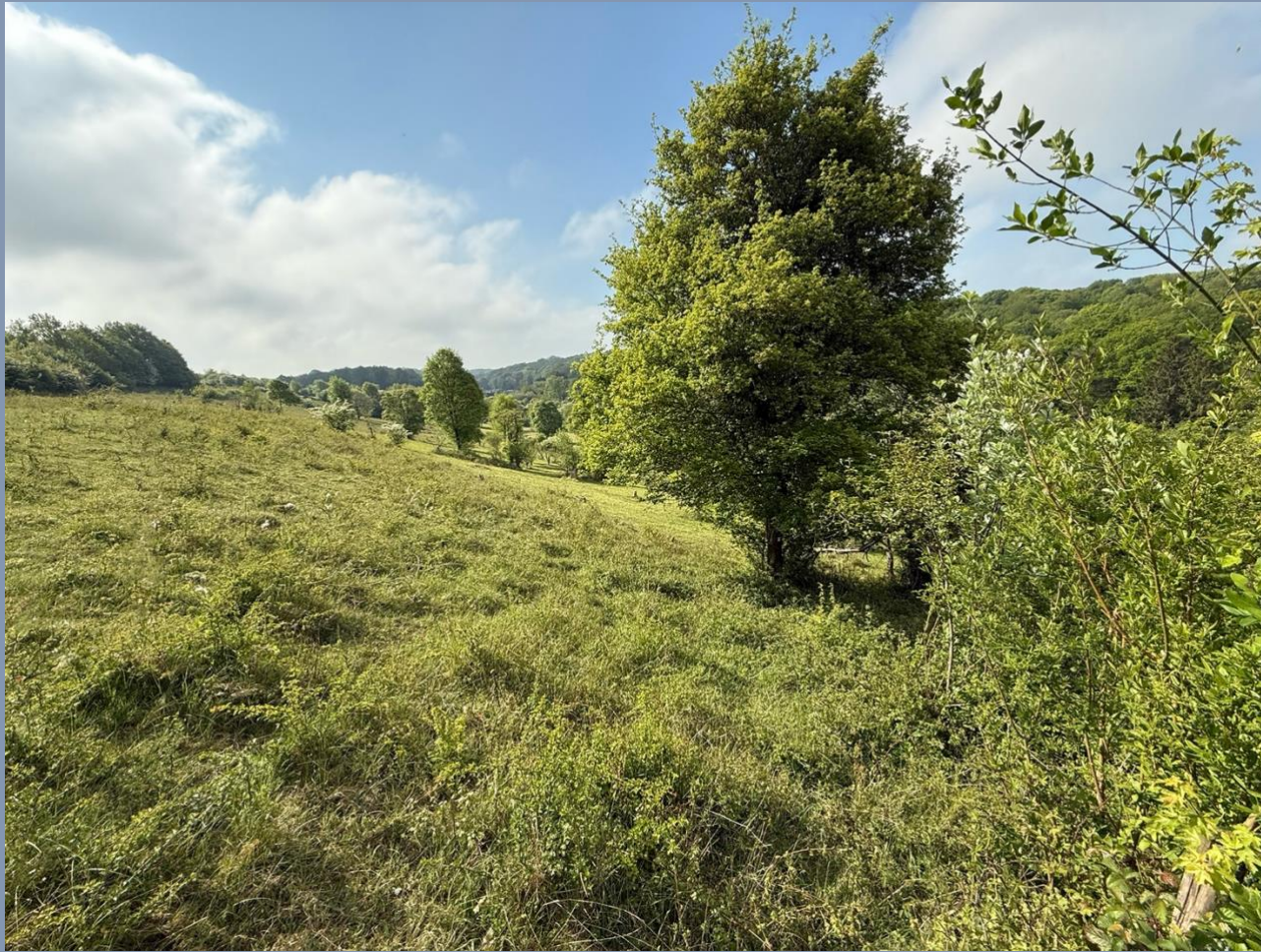
Hutchinson's Bank, 14 acres of chalk grassland just south of Croydon in Greater London.