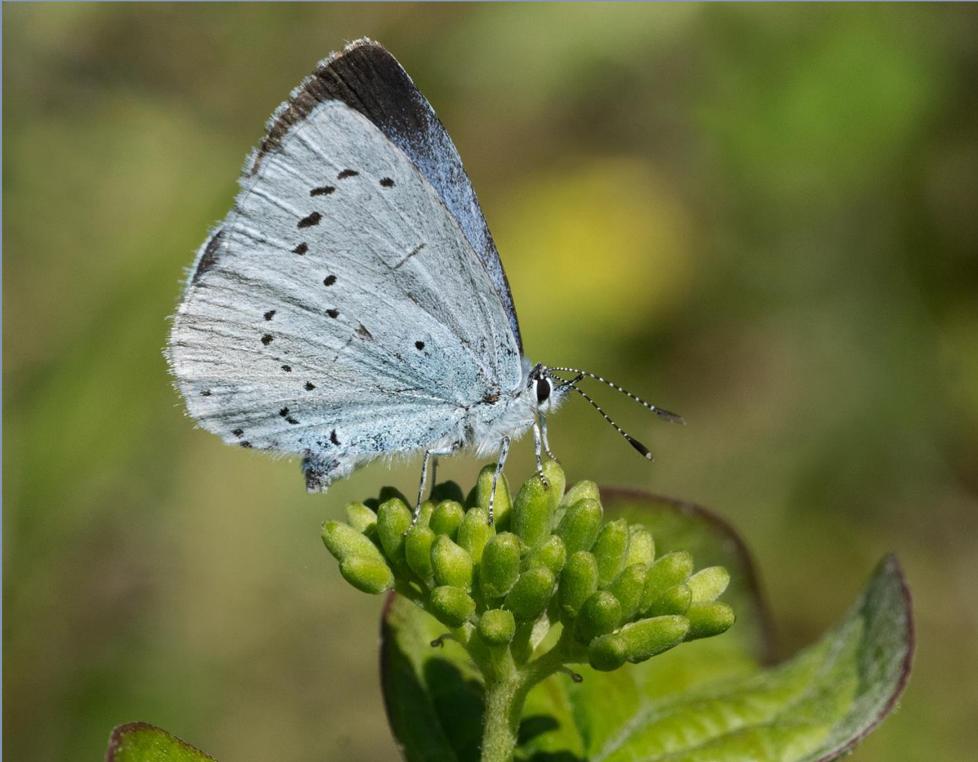
Holly Blue ( Celastrina argiolus ) Female underside.