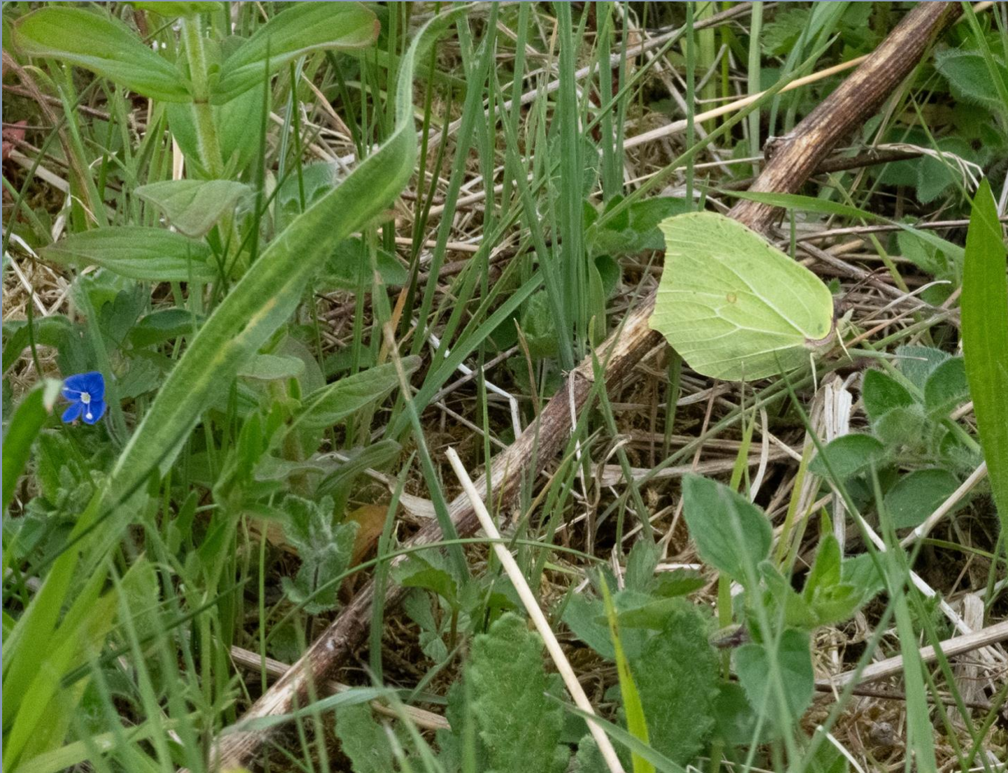
Brimstone ( Tamas Nestor ) Male underside.