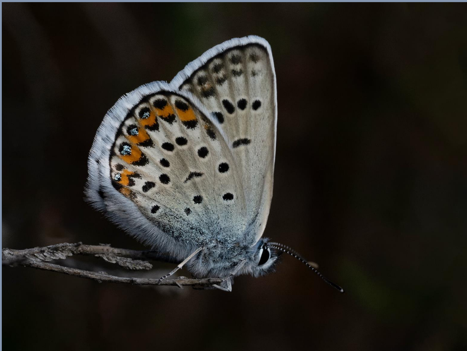
Silver-studded Blue ( Plebejus argus ) Male underwing.