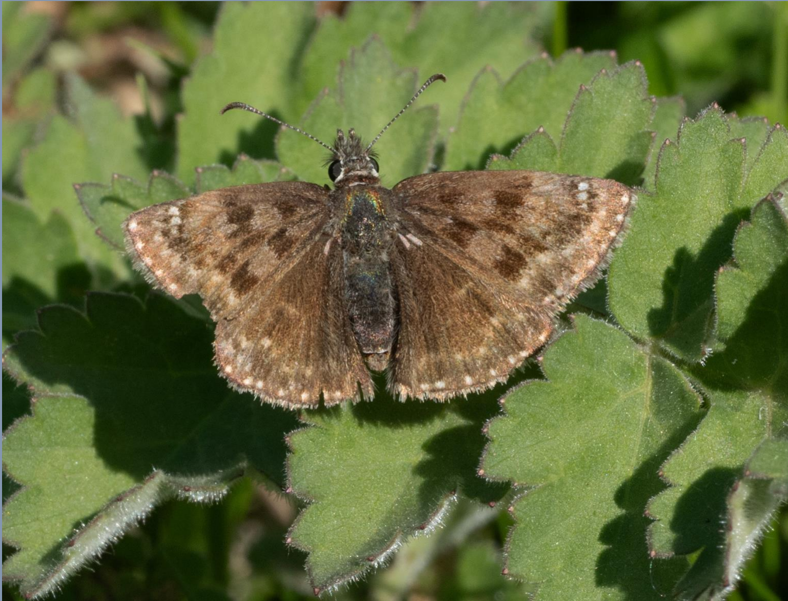
Dingy Skipper ( Erynnis tages )