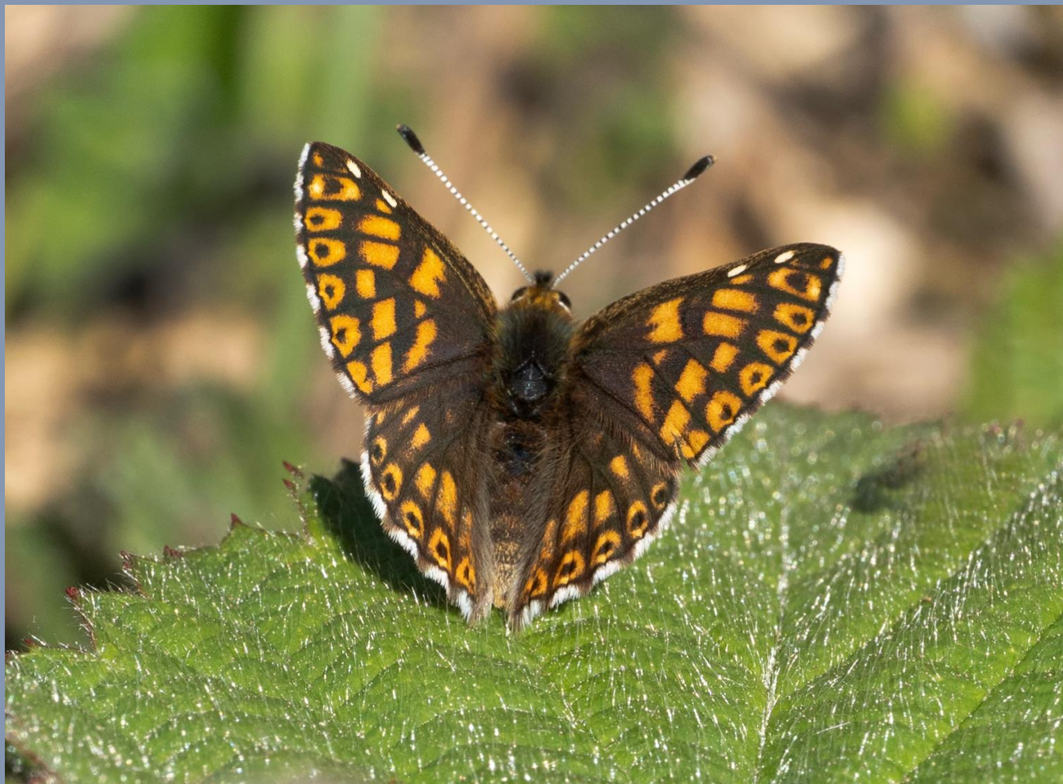
Duke of Burgundy ( Hamearis Lucina ) Male