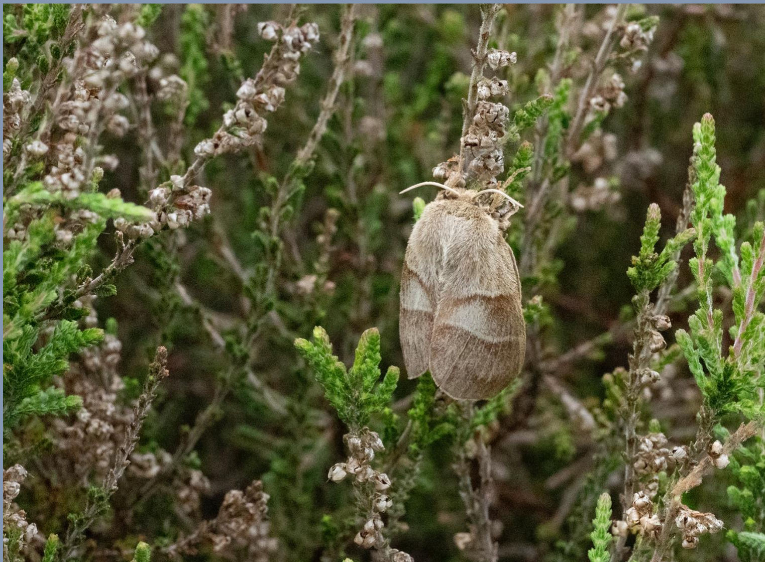
Fox Moth ( Macrothylacia rubi ) Female