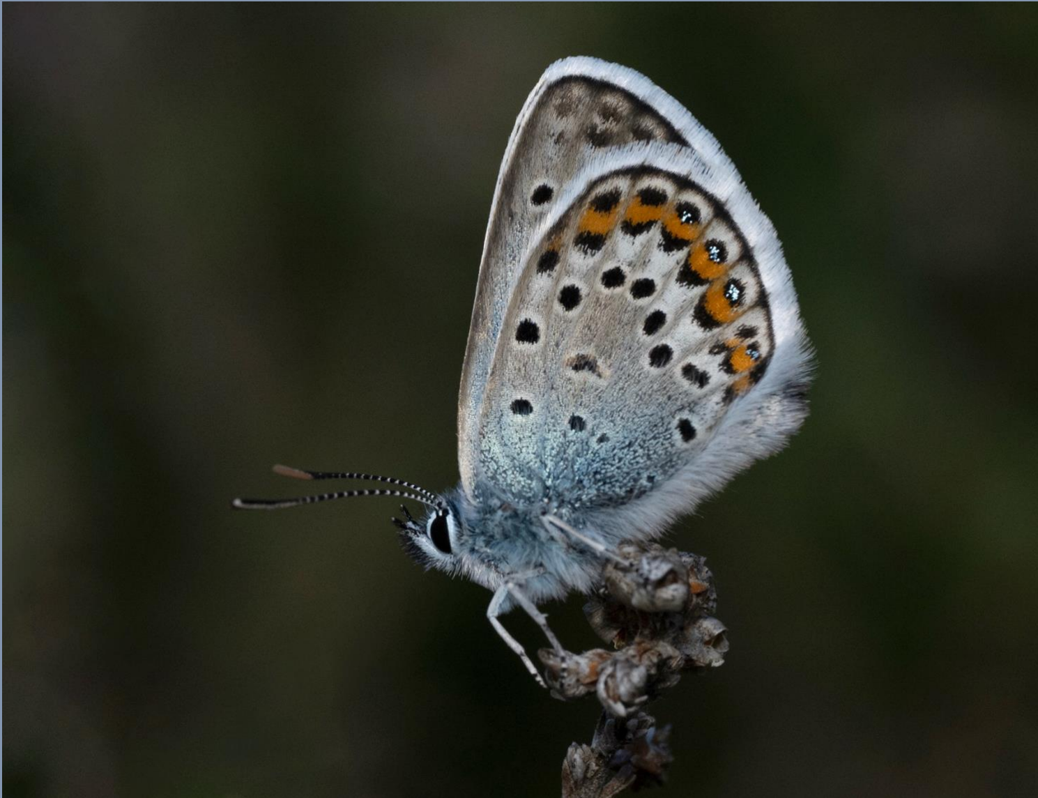
Silver-studded Blue ( Plebejus argus ) Male underwing.