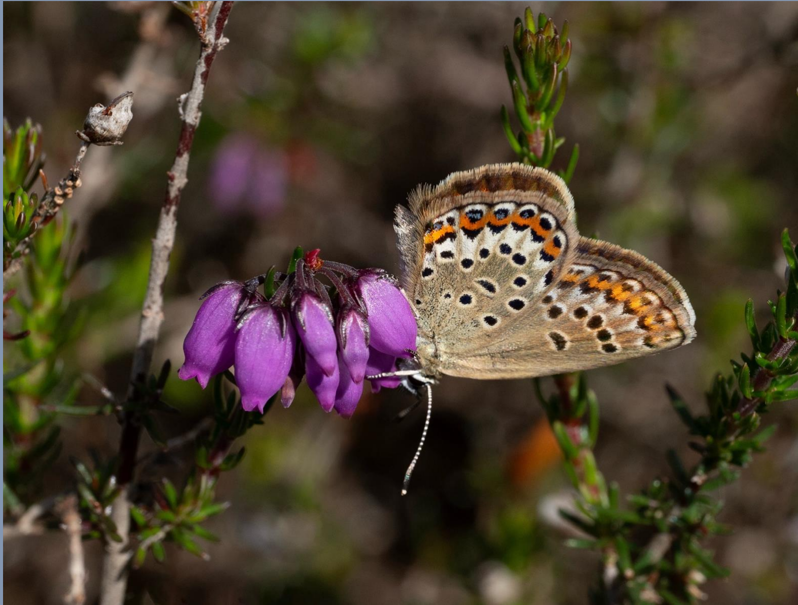
Silver-studded Blue ( Plebejus argus ) Female underwing.